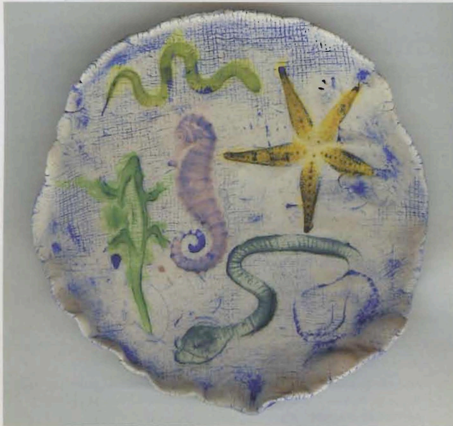
Figure 1. Fossil Project Result

originated. Figure 1 shows an art product from that lesson on fossils.